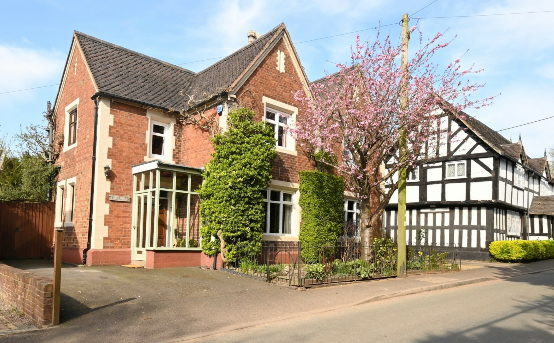
Holly Cottage , Main Road, Harlaston, B79 9JX