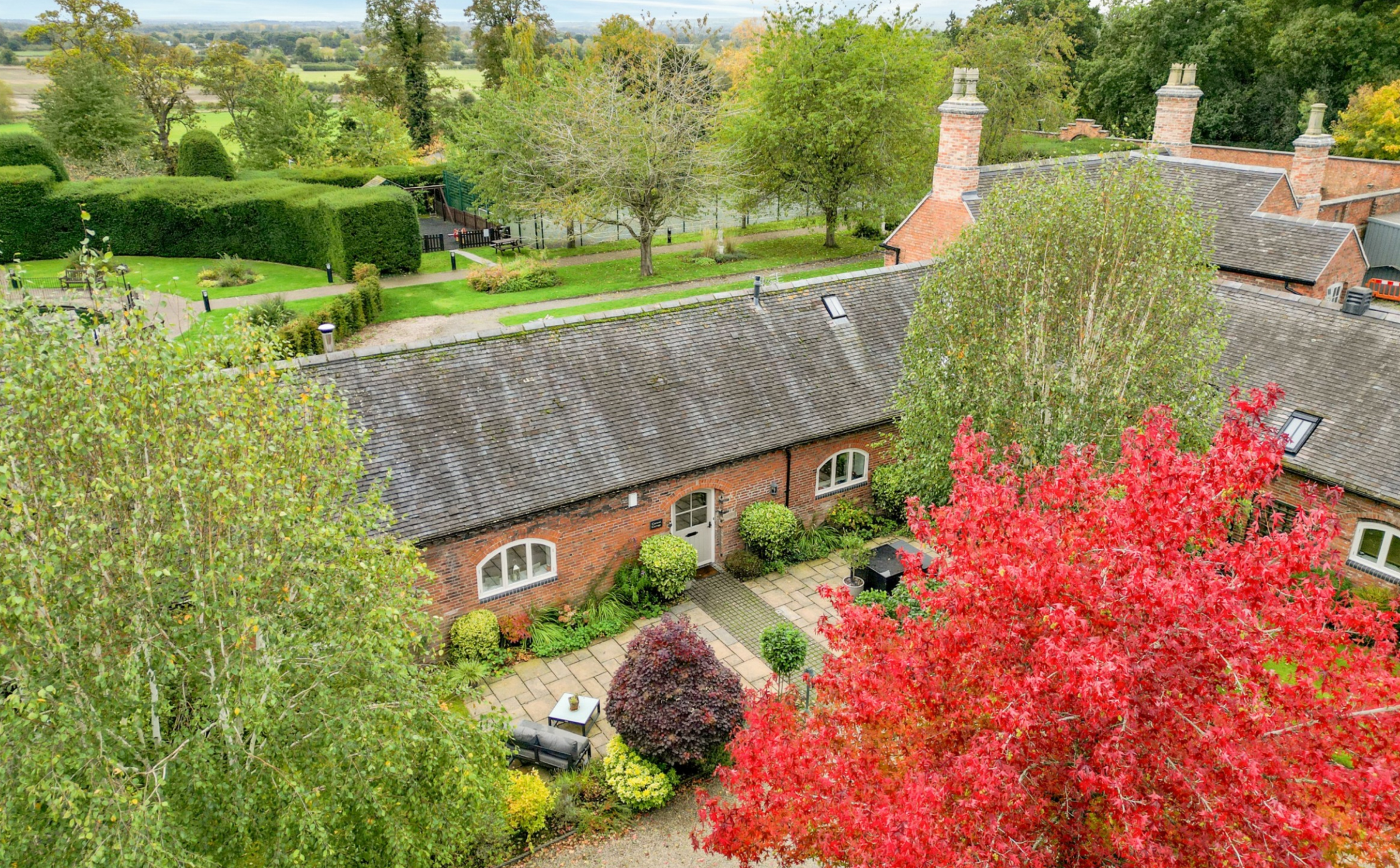
Cutters Cottage, The Grange, Wychnor, DE13 8BU