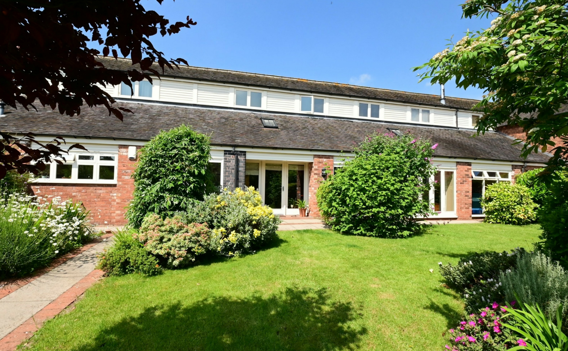
Blithfield Cottage, Yeatsall Lane, Abbots Bromley, WS15 3DY