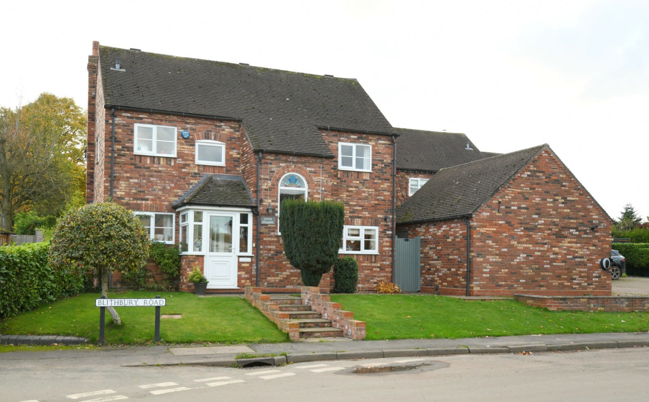
Little Steading, Blithbury Road, Hamstall Ridware, WS15 3RR