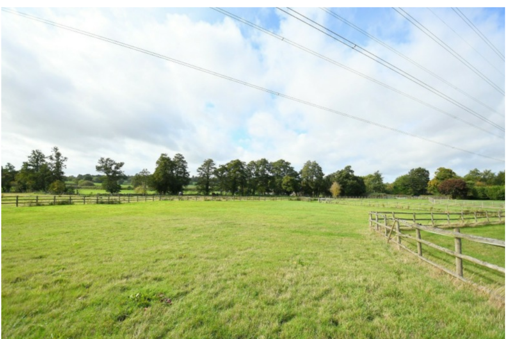
Land by Separate Negotiation