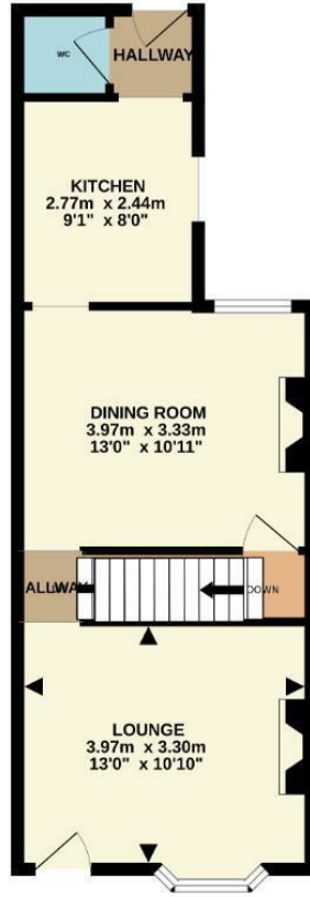
GROUND FLOOR 39.8 sq.m. (423 sq.ft.) approx.