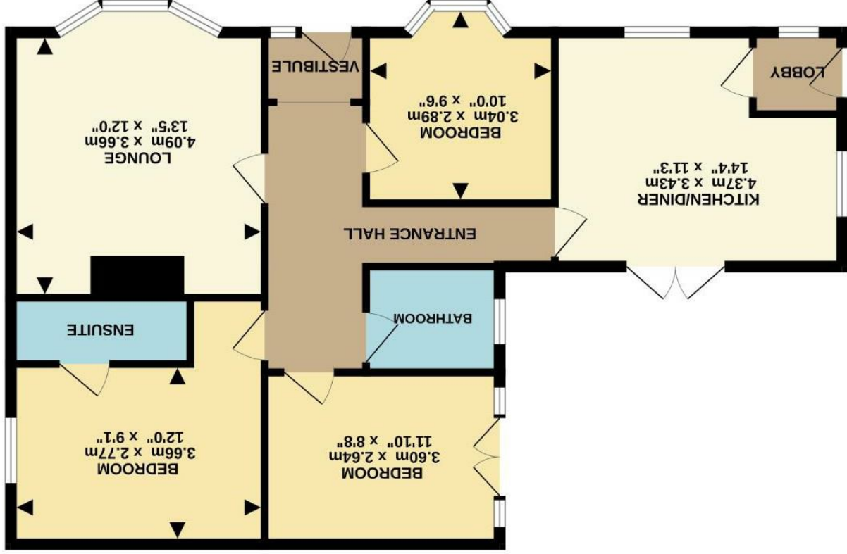
GROUND FLOOR 78.3 sq.m. (842 sq.ft.) approx.

Whilst every attempt has been made to ensure the accuracy of the floorplan contained here, measurements of doors, windows, rooms and any other items are approximate and no responsibility is taken for any error, omission or mis-statement. This plan is for illustrative purposes only and should be used as such by any prospective purchaser. The services, systems and appliances shown have not been tested and no guarantee as to their operability or efficiency can be given. Made with Neopix ©2025