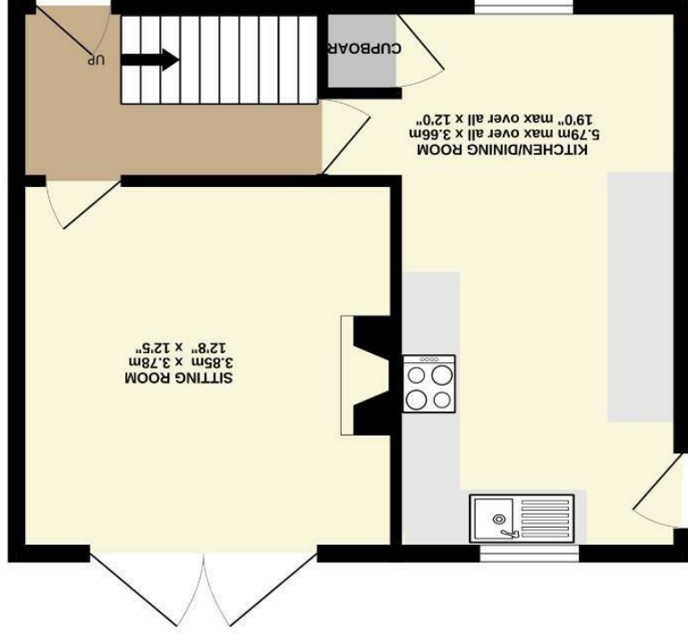
GROUND FLOOR 37.0 sq.m. (398 sq.ft.) approx.

TOTAL FLOOR AREA: 74.6 sq.m. (803 sq.ft.) approx.