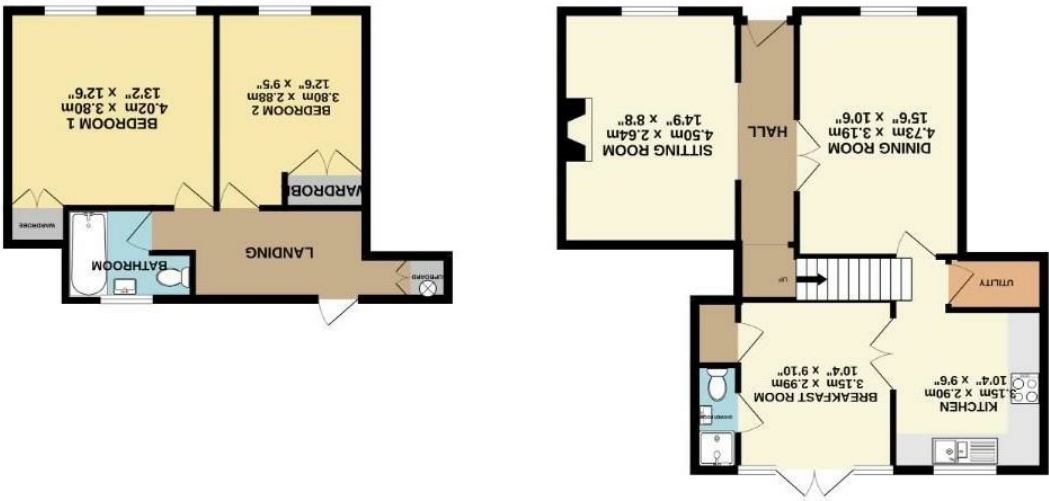
TOTAL FLOOR AREA: 133.1 sq.m. (1432 sq.ft.) approx.

Whilst every attempt has been made to ensure the accuracy of the floorplan contained here, measurements of doors, windows, rooms and any other items are approximate and no responsibility is taken for any error, omission or mis-statement. This plan is for illustrative purposes only and should be used as such by any prospective purchaser. The services, systems and appliances shown have not been tested and no guarantee as to their operability or efficiency can be given.