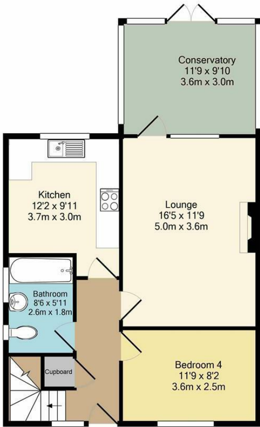
GROUND FLOOR APPROX. FLOOR AREA 649 SQ.FT. (60.3 SQ.M.)