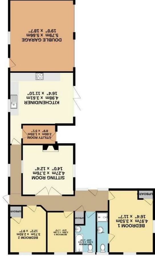
GROUND FLOOR 128.0 sq.m. (1377 sq.ft.) approx.

TOTAL FLOOR AREA: 128.0 sq.m. (1377 sq.ft.) approx. What every attempt has been made to ensure the accuracy of the floorplan contained here, measurements of space, windows, doors and any other items are not guaranteed to match as such by any prospective purchaser. The services, systems and appliances shown have not been tested and no guarantee is given as to their operability or efficiency can be given. Made with Mapbox ©2024