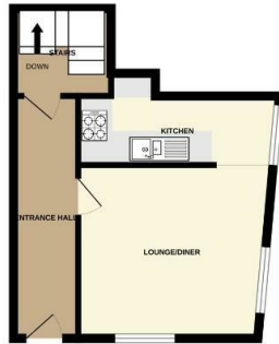
GROUND FLOOR 291 sq.ft. (27.0 sq.m.) approx.