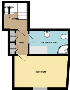
BASEMENT LEVEL 242 sq.ft. (22.3 sq.m.) approx.