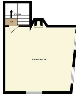
1ST FLOOR 288 sq.ft. (26.8 sq.m.) approx.