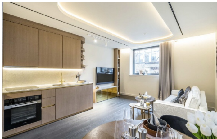
Fareham Street, W1F