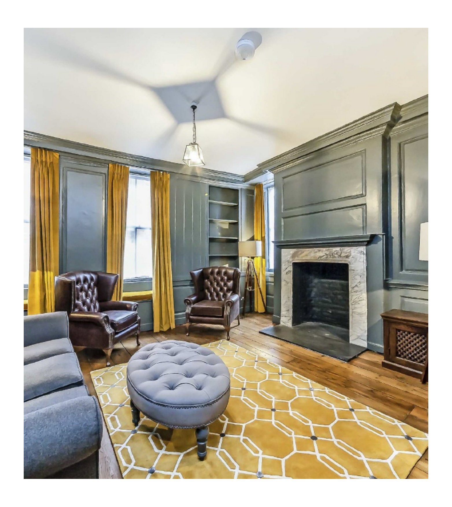
Meard Street, W1F £2,300 Per week