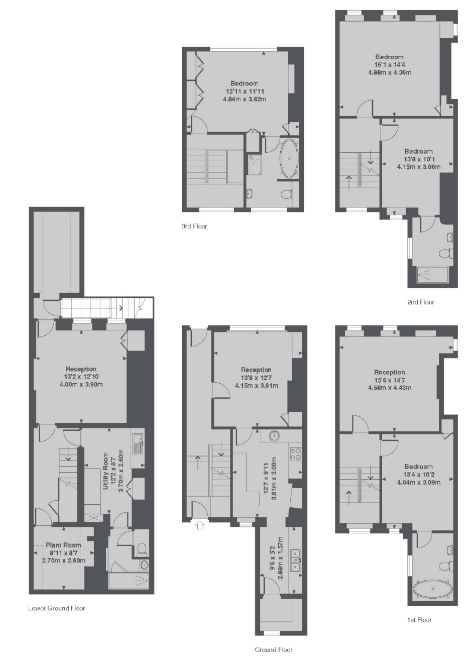
Meard Street, W1F Total Approx. Floor area 2431 Sq. Ft. (225.8 Sq. M.)