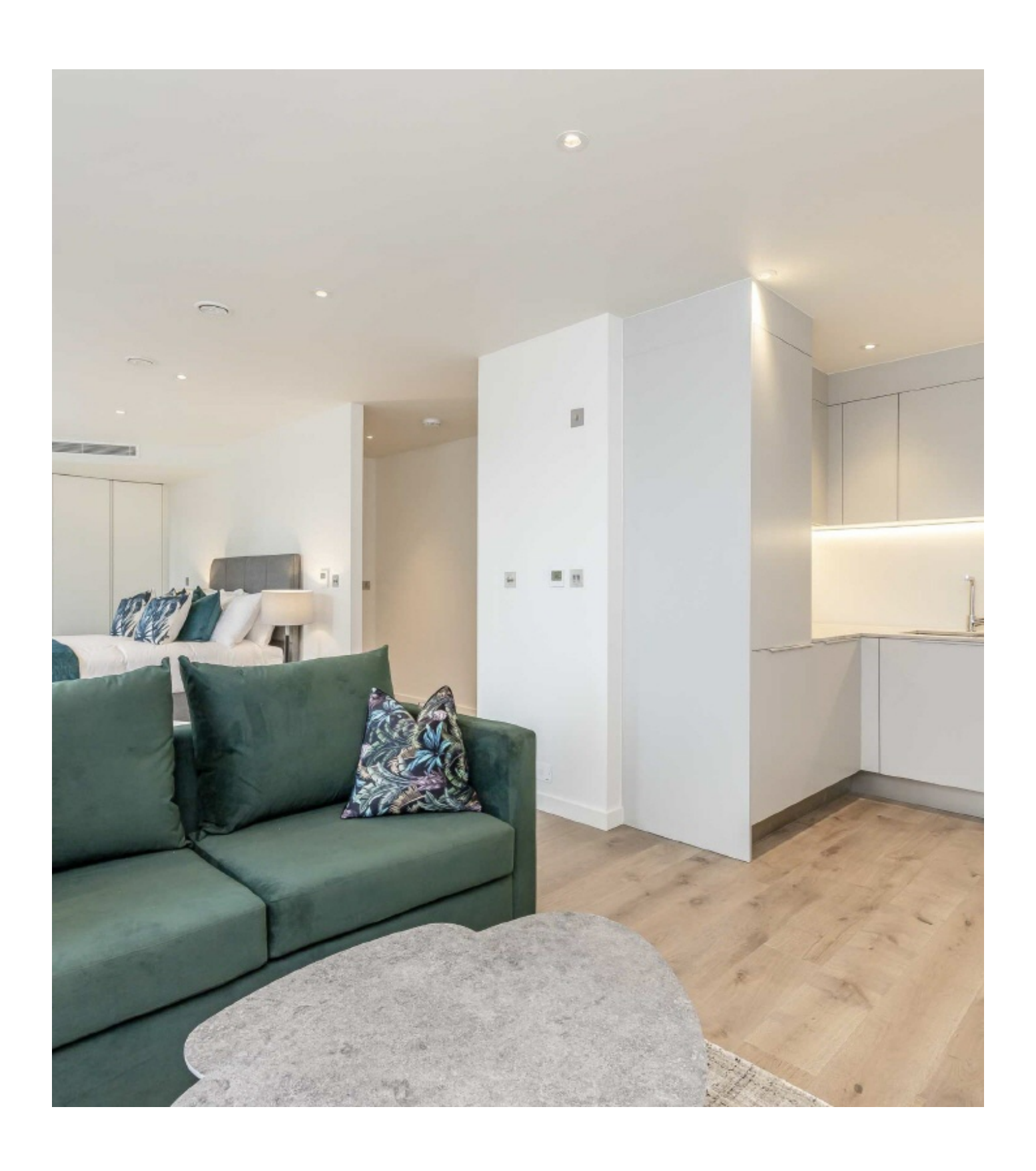
Suffolk Street, SW1Y £600 Per week