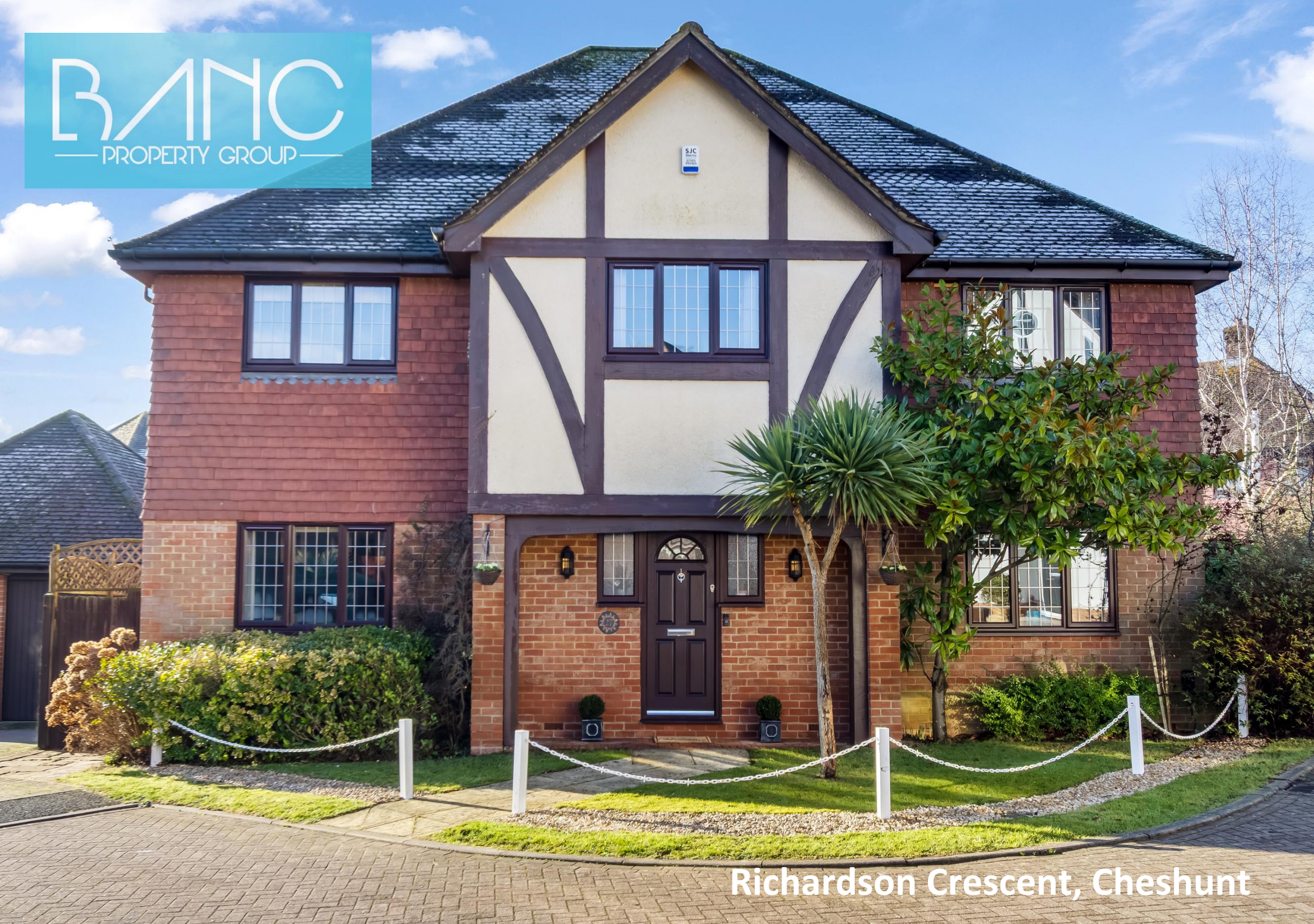
Richardson Crescent, Cheshunt