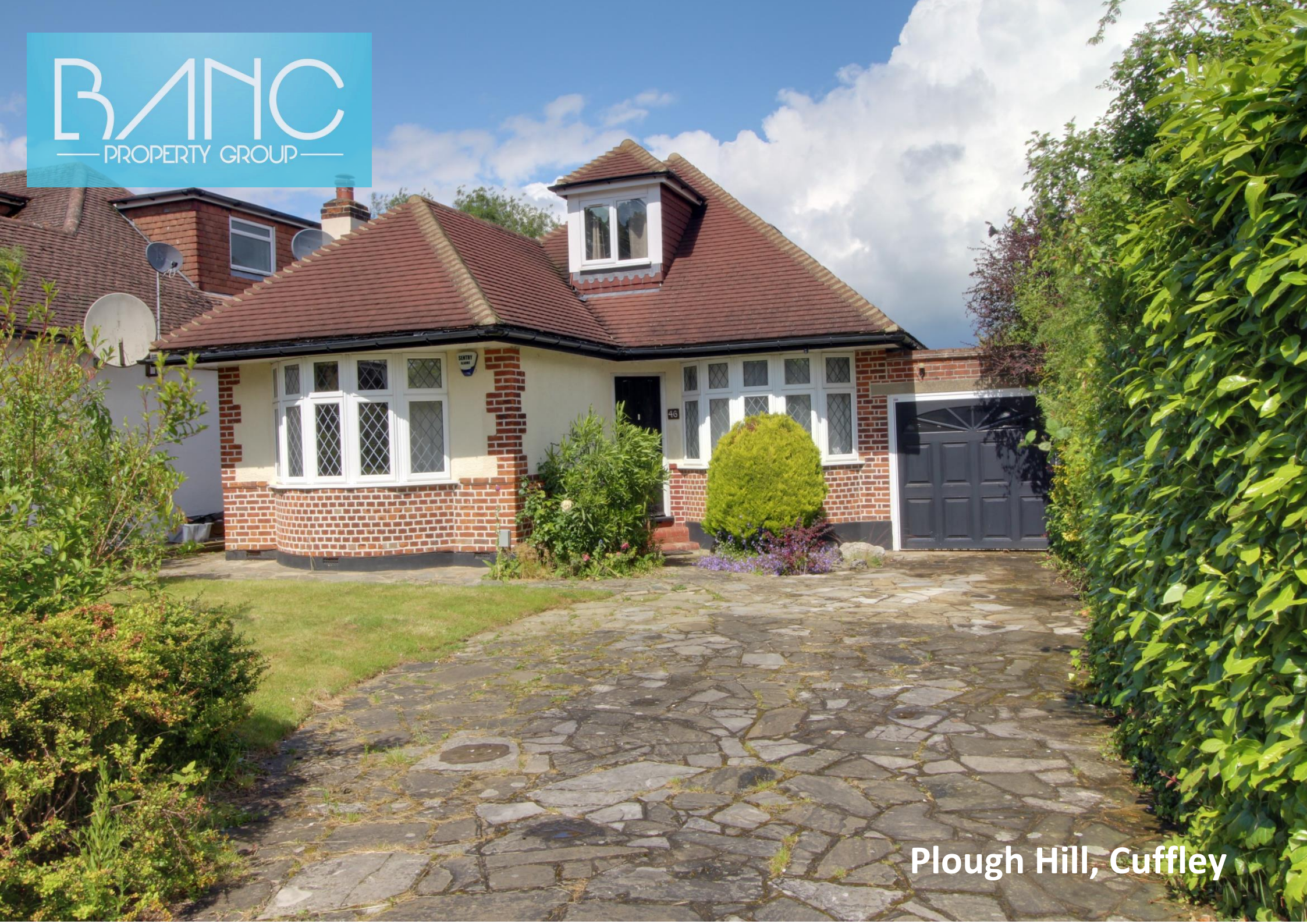
Plough Hill, Cuffley