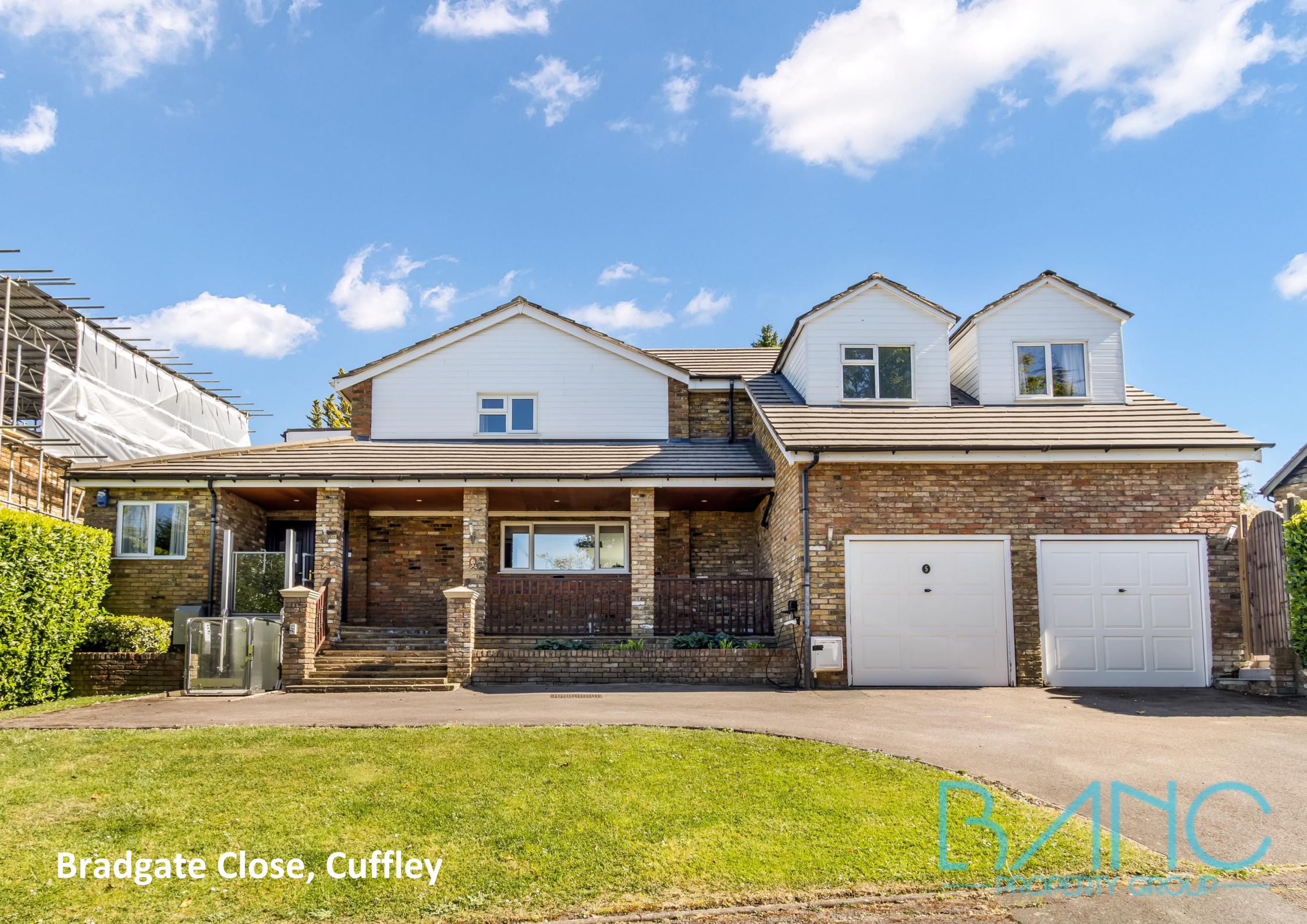
Bradgate Close, Cuffley