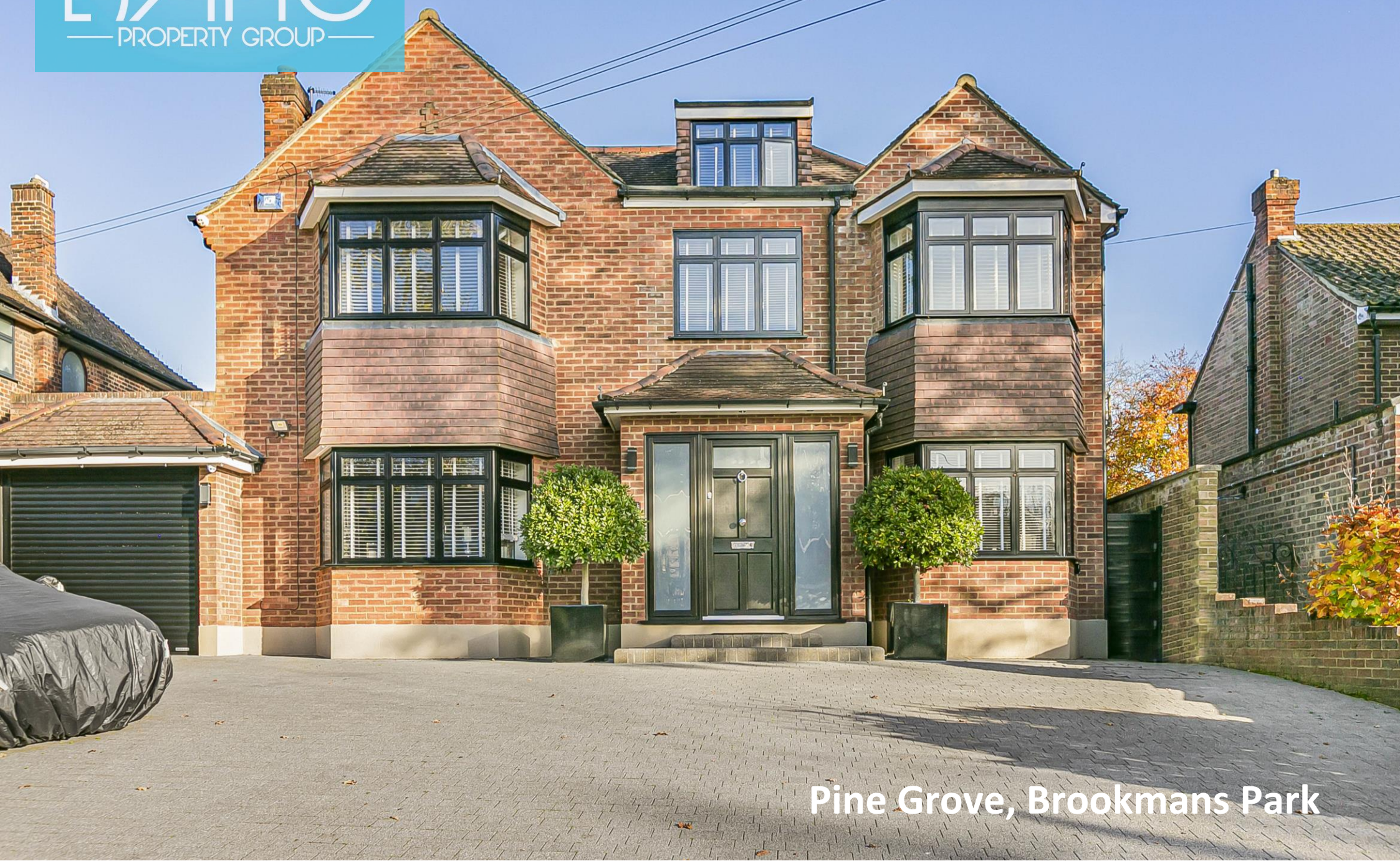
Pine Grove, Brookmans Park