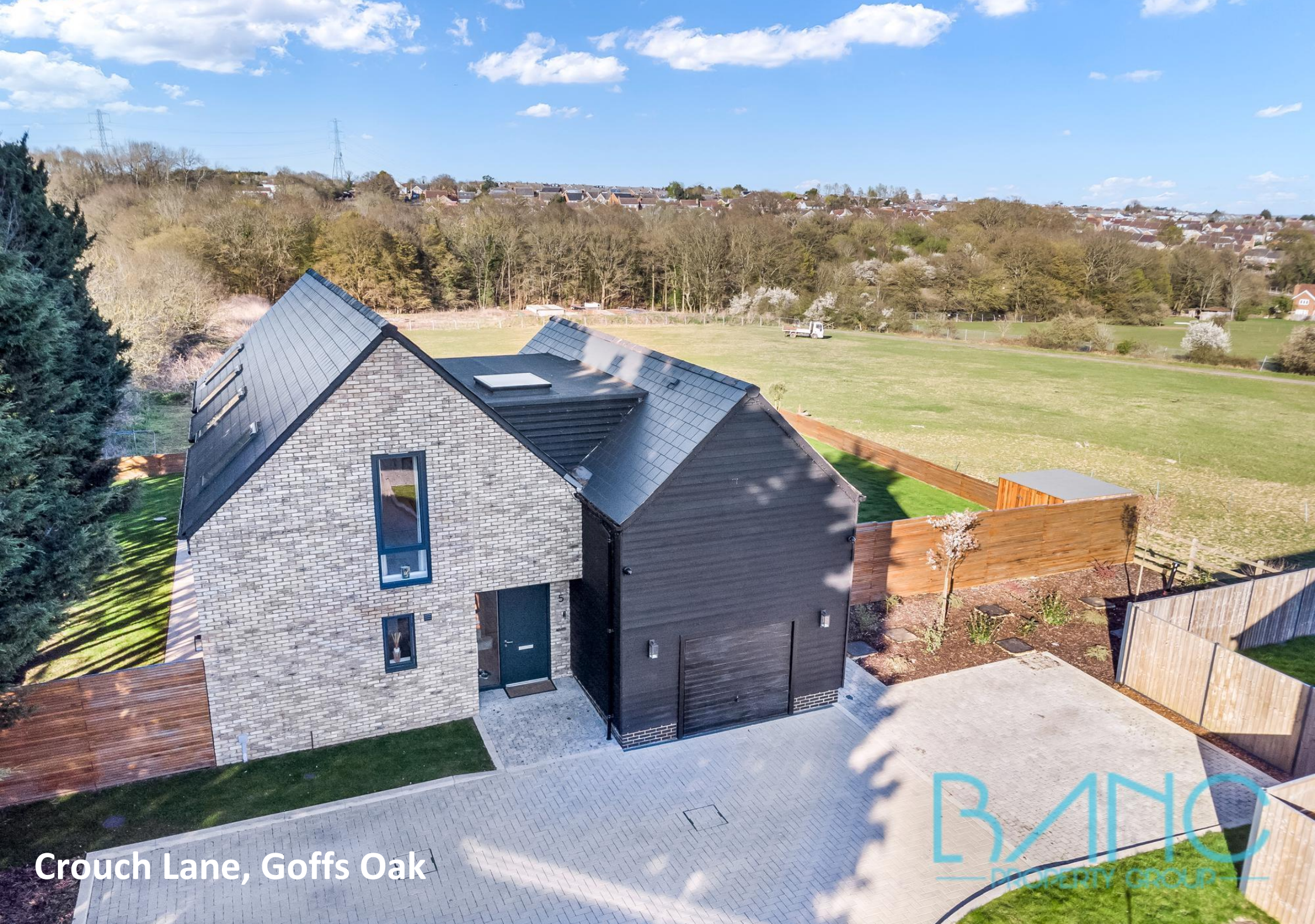
Crouch Lane, Goffs Oak