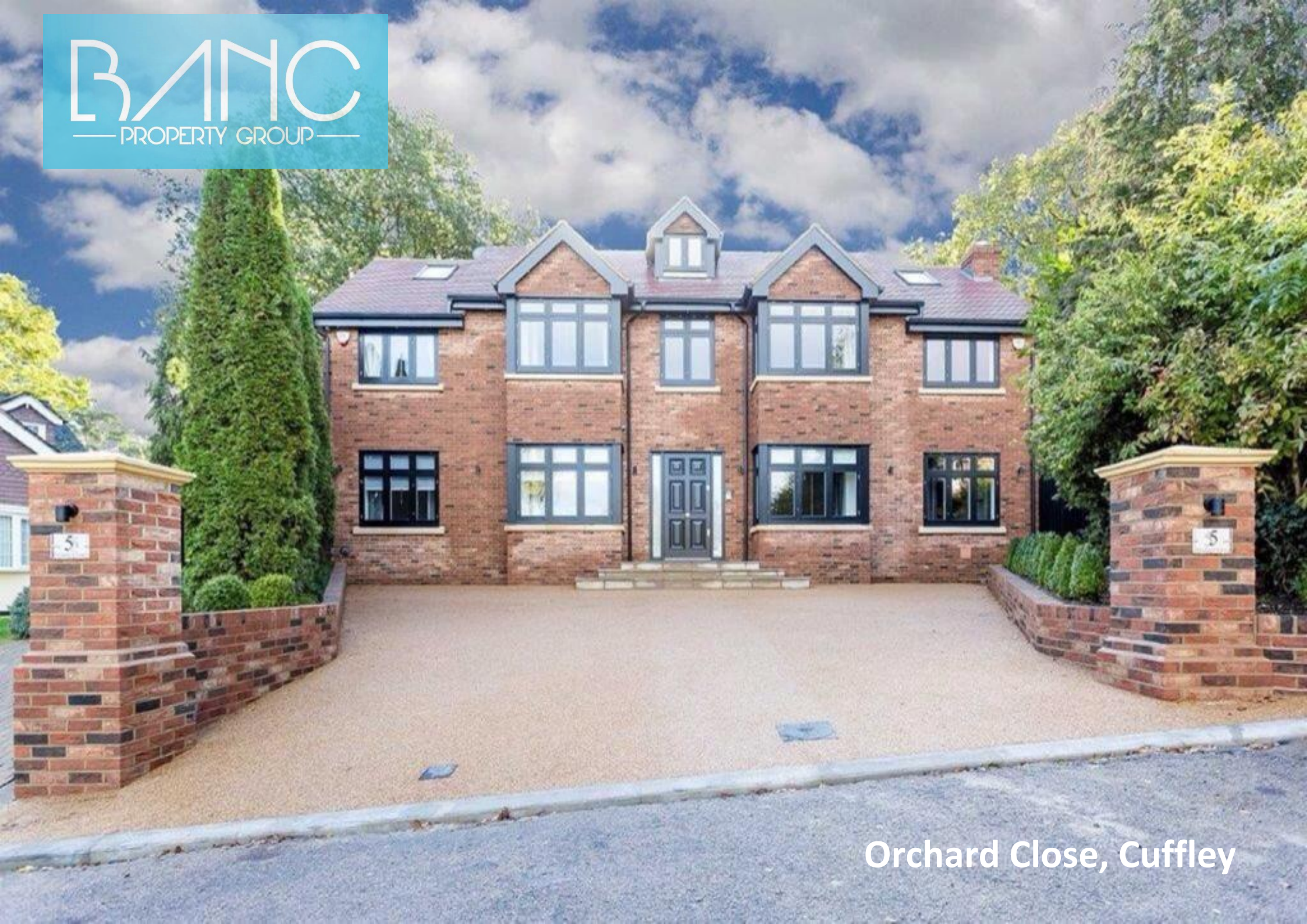
Orchard Close, Cuffley