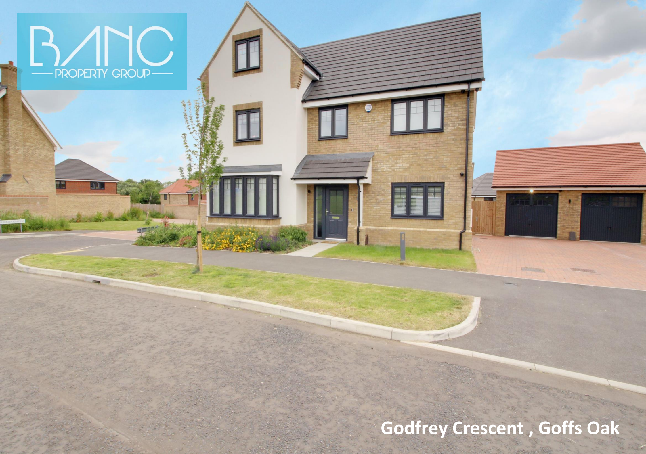
Godfrey Crescent , Goffs Oak