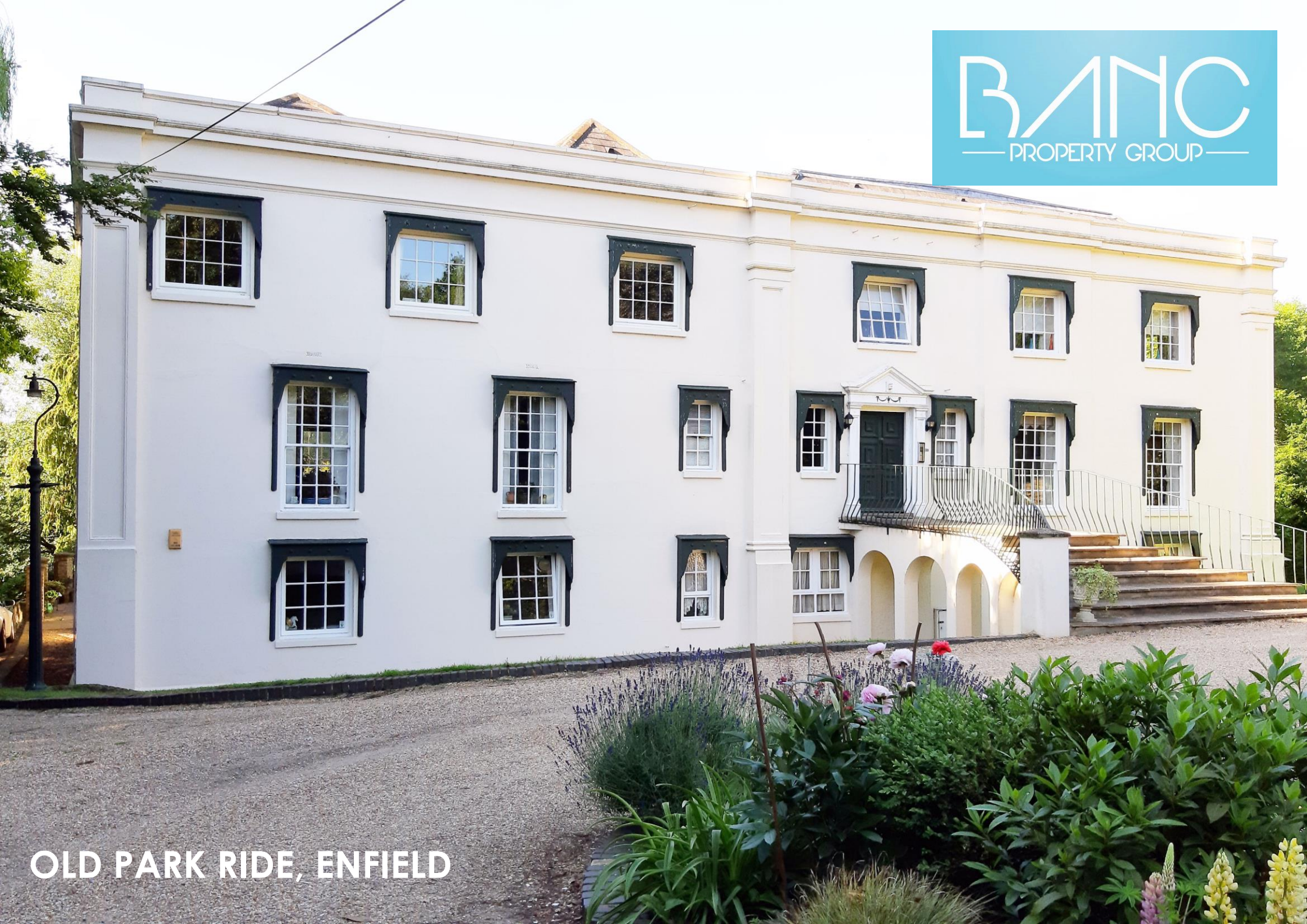
OLD PARK RIDE, ENFIELD