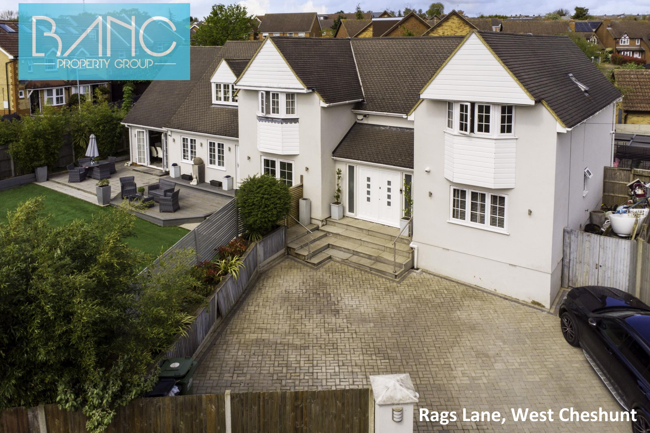
Rags Lane, West Cheshunt