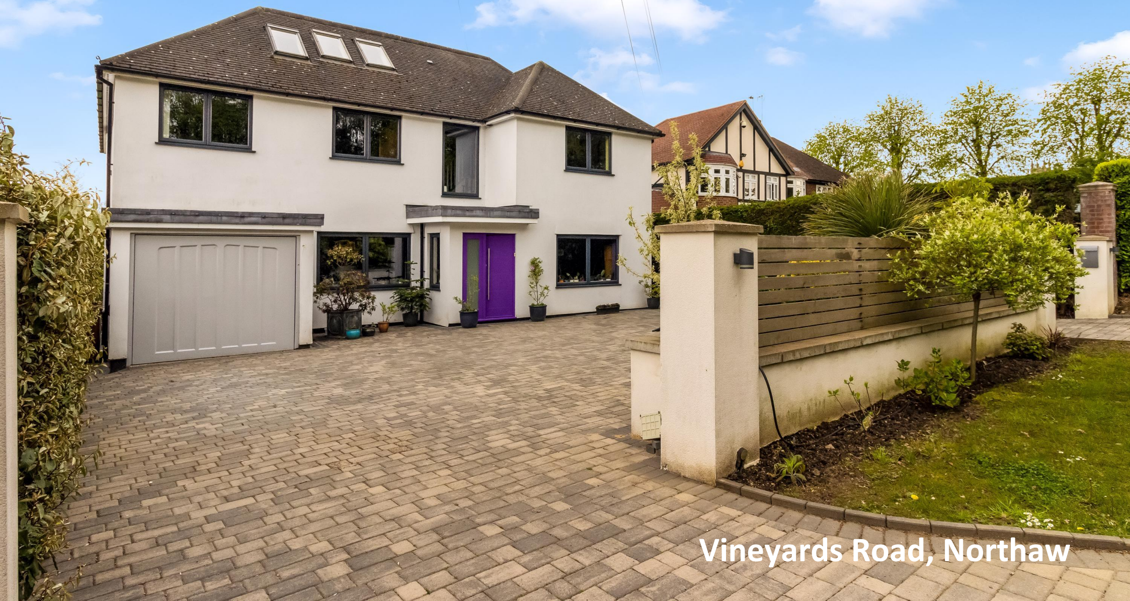
Vineyards Road, Northaw