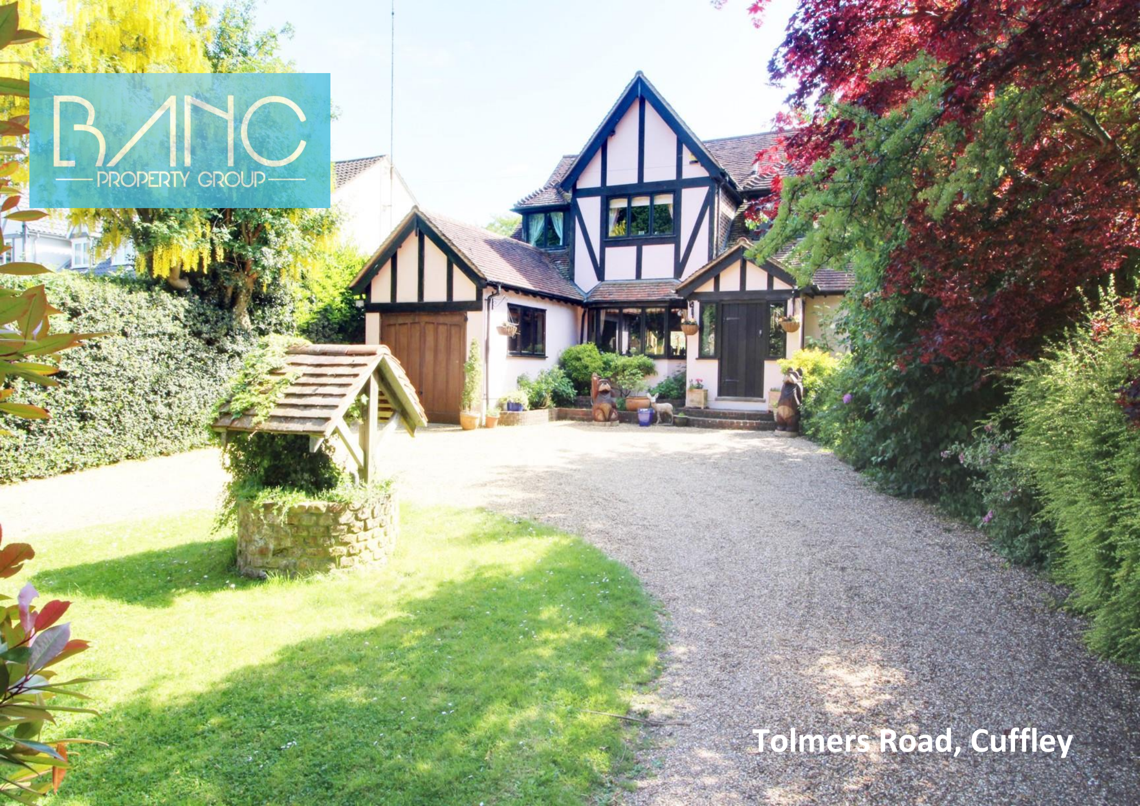
Tolmers Road, Cuffley