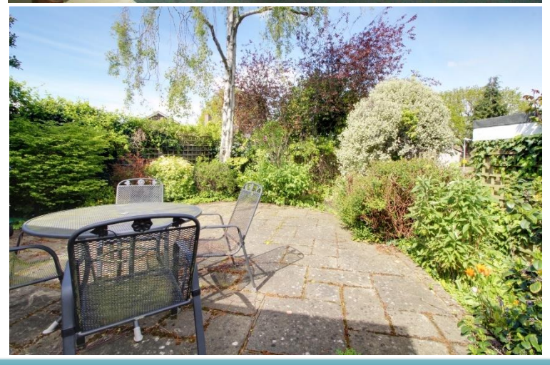
High Ridge, Cuffley, EN6

APPROX GROSS INTERNAL FLOOR AREA: 1436 sq. ft / 134 sq. m