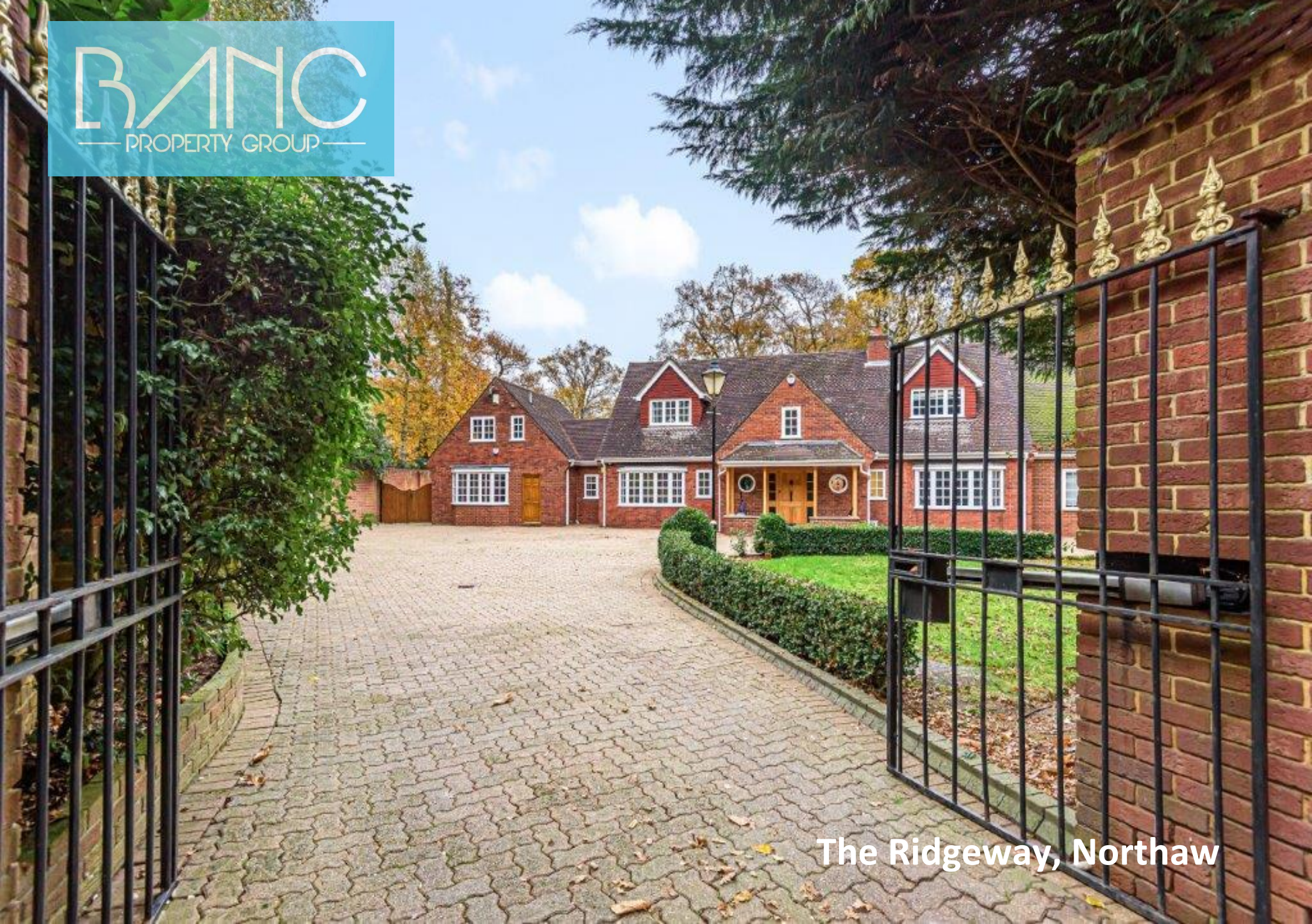
The Ridgeway, Northaw