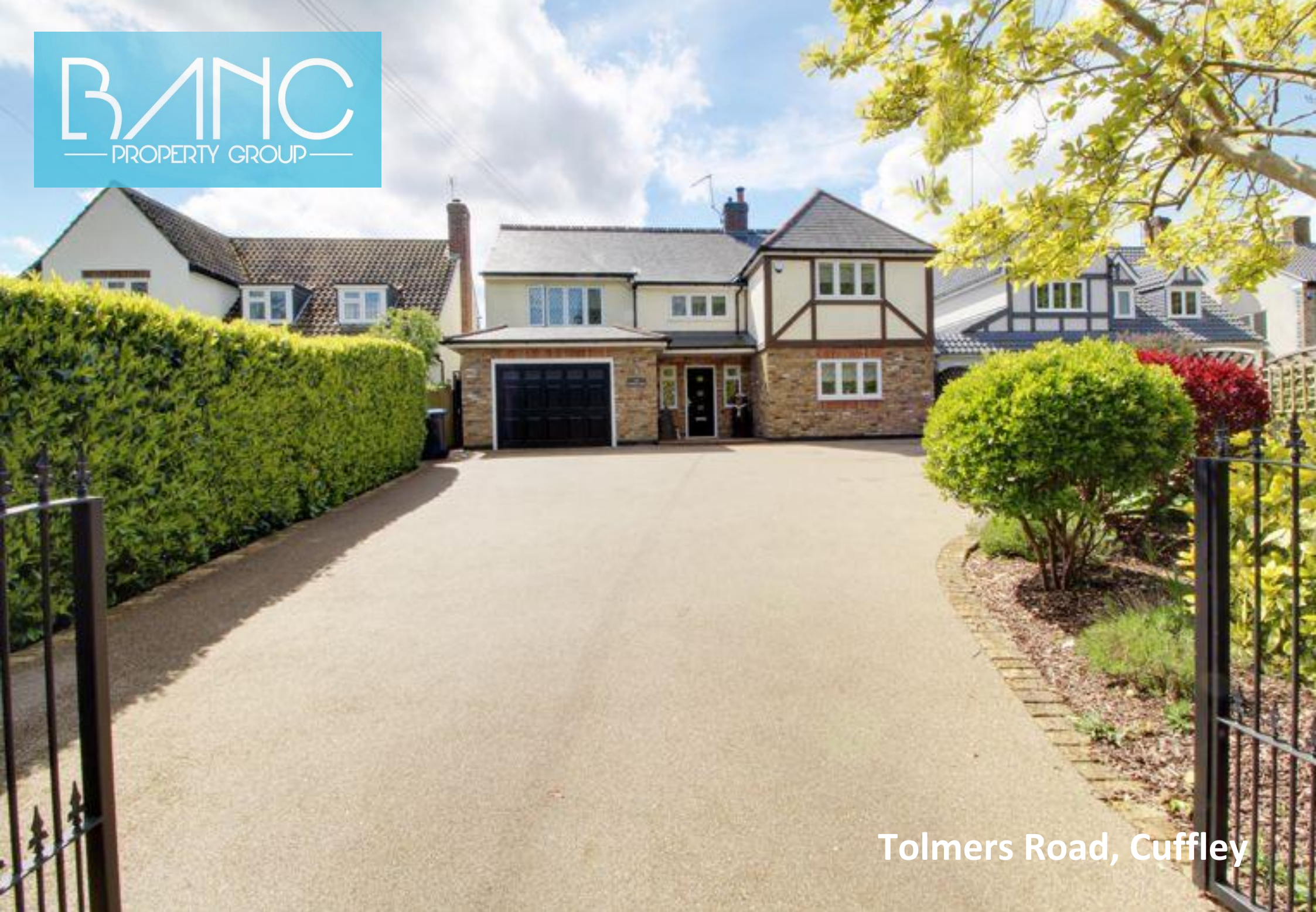
Tolmers Road, Cuffley