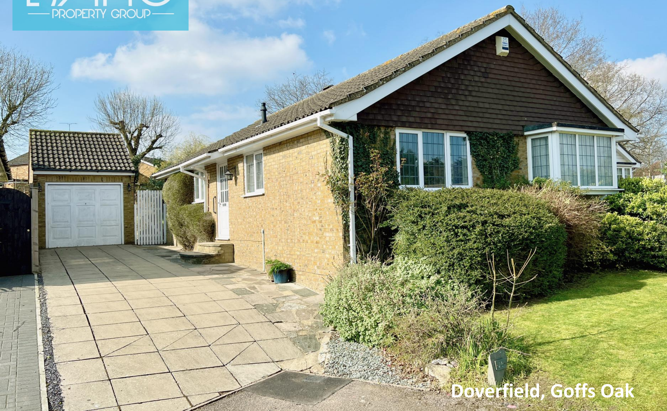
Doverfield, Goffs Oak