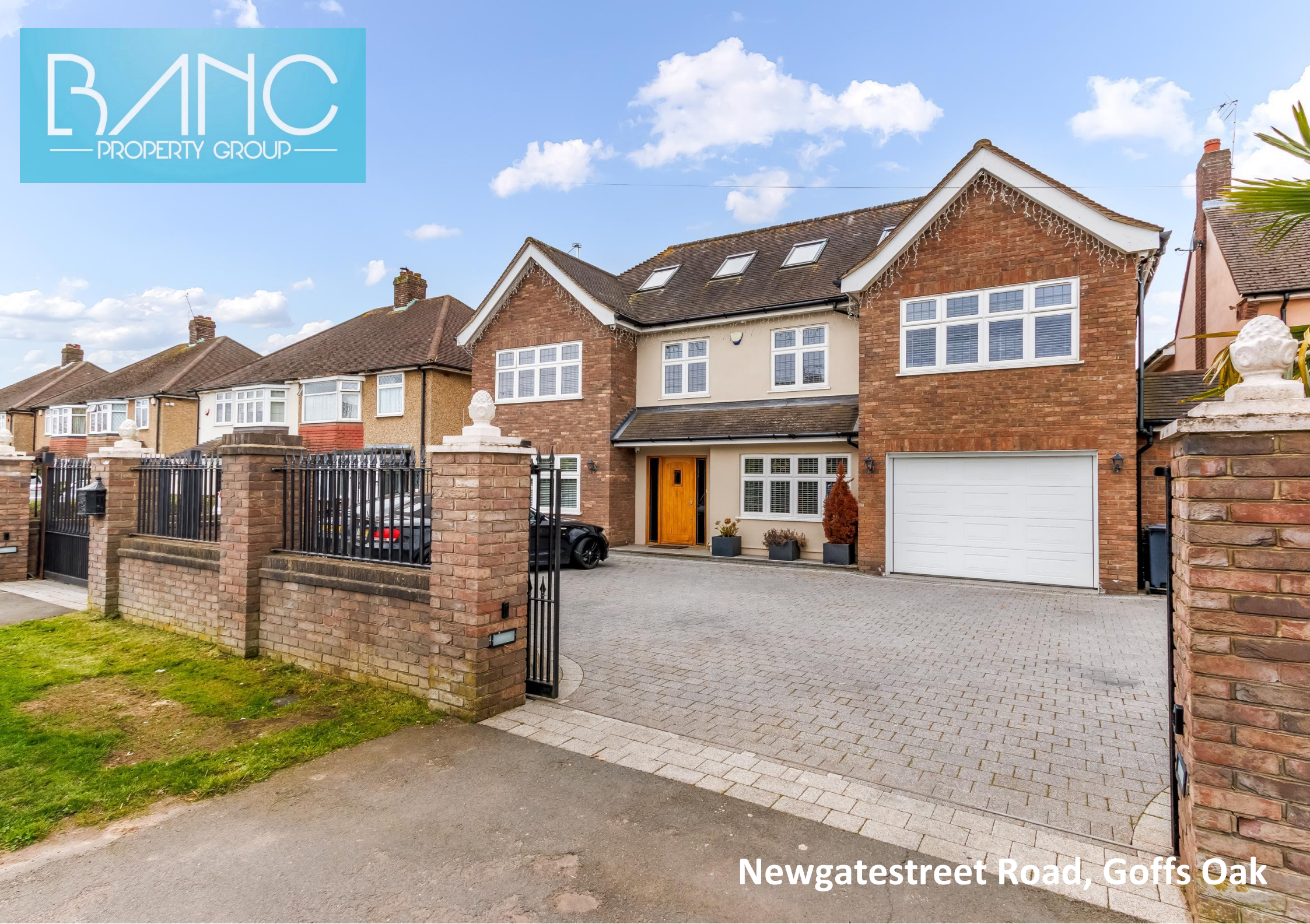
Newgatestreet Road, Goffs Oak