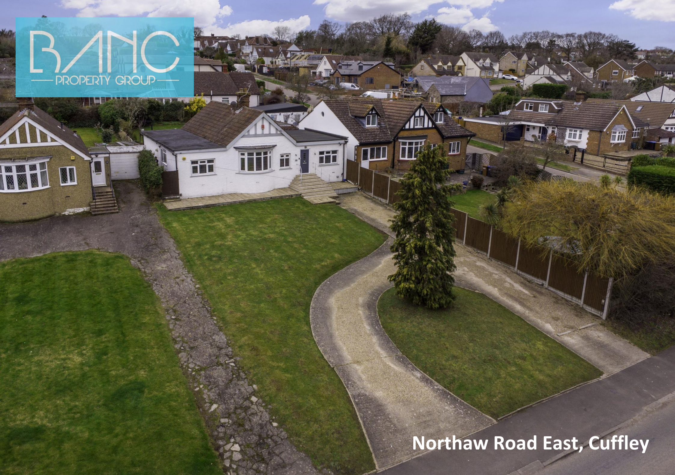
Northaw Road East, Cuffley