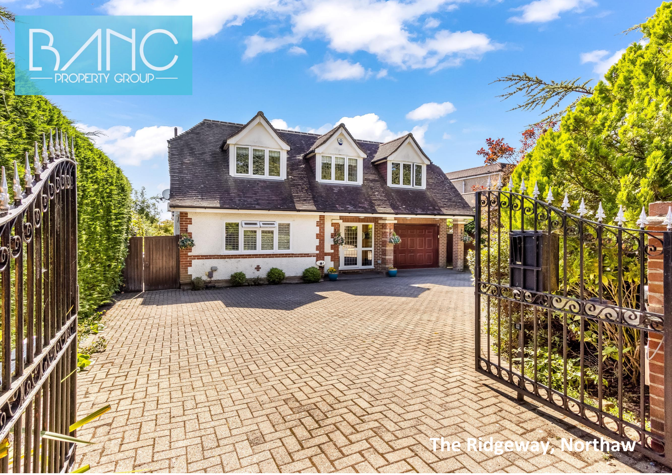
The Ridgeway, Northaw