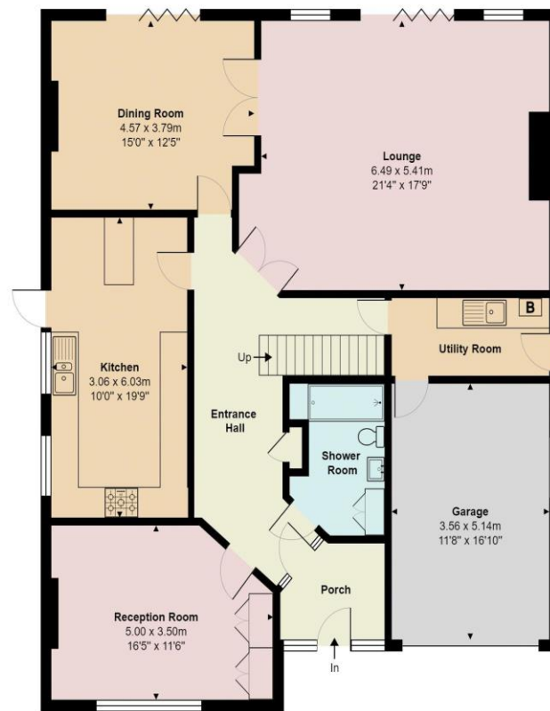
Ground Floor Area: 145.5 m 2 ... 1566 ft 2