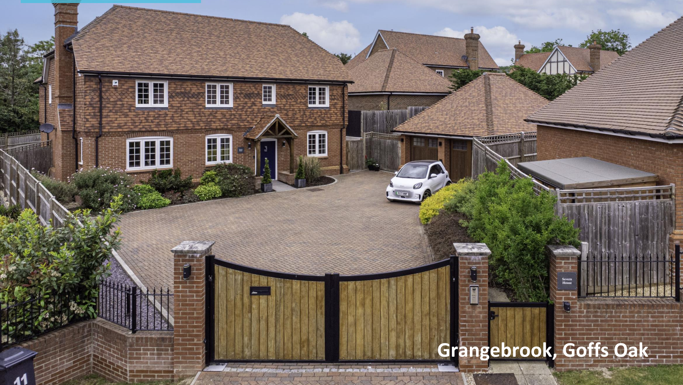
Grangebrook, Goffs Oak