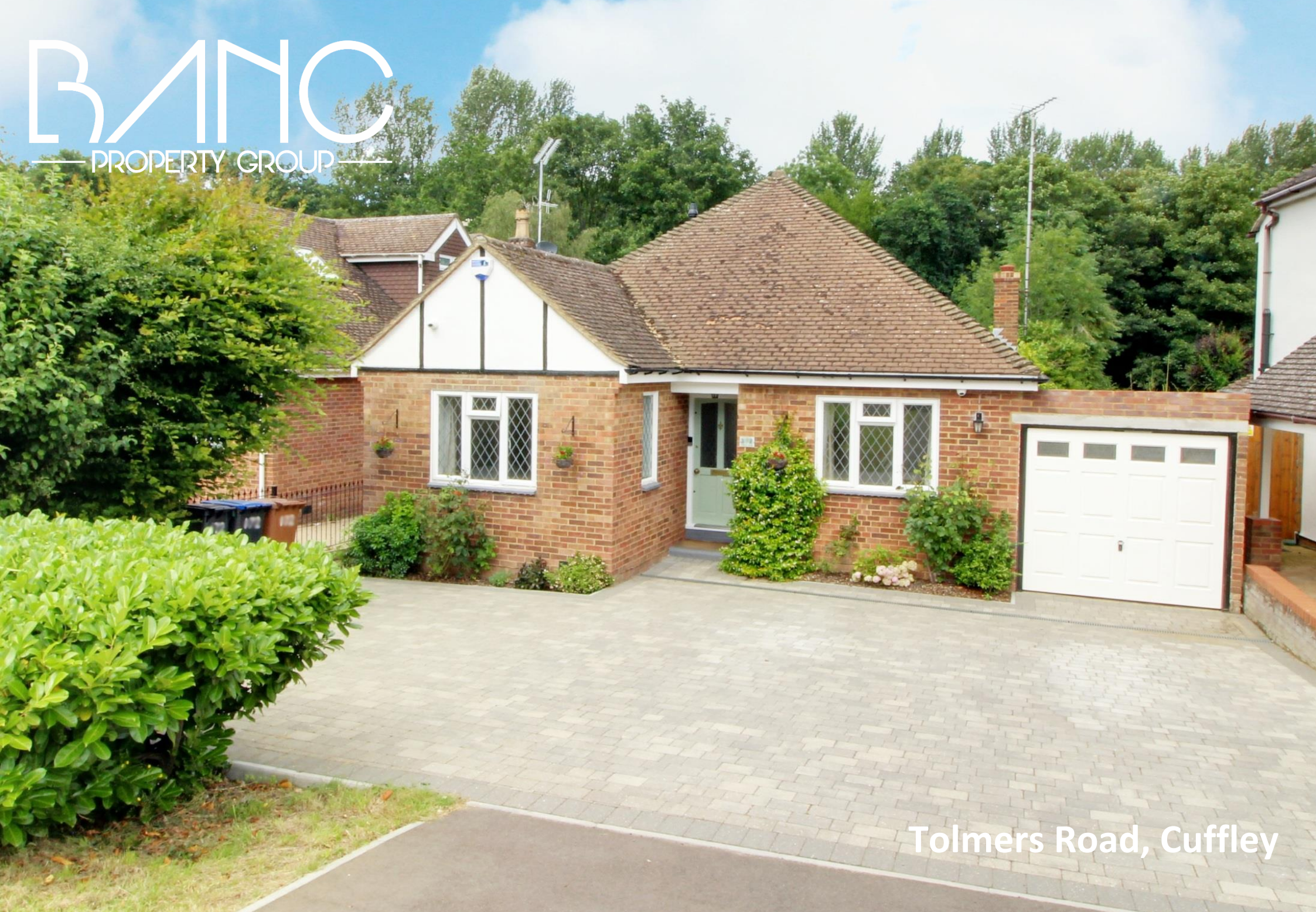
Tolmers Road, Cuffley