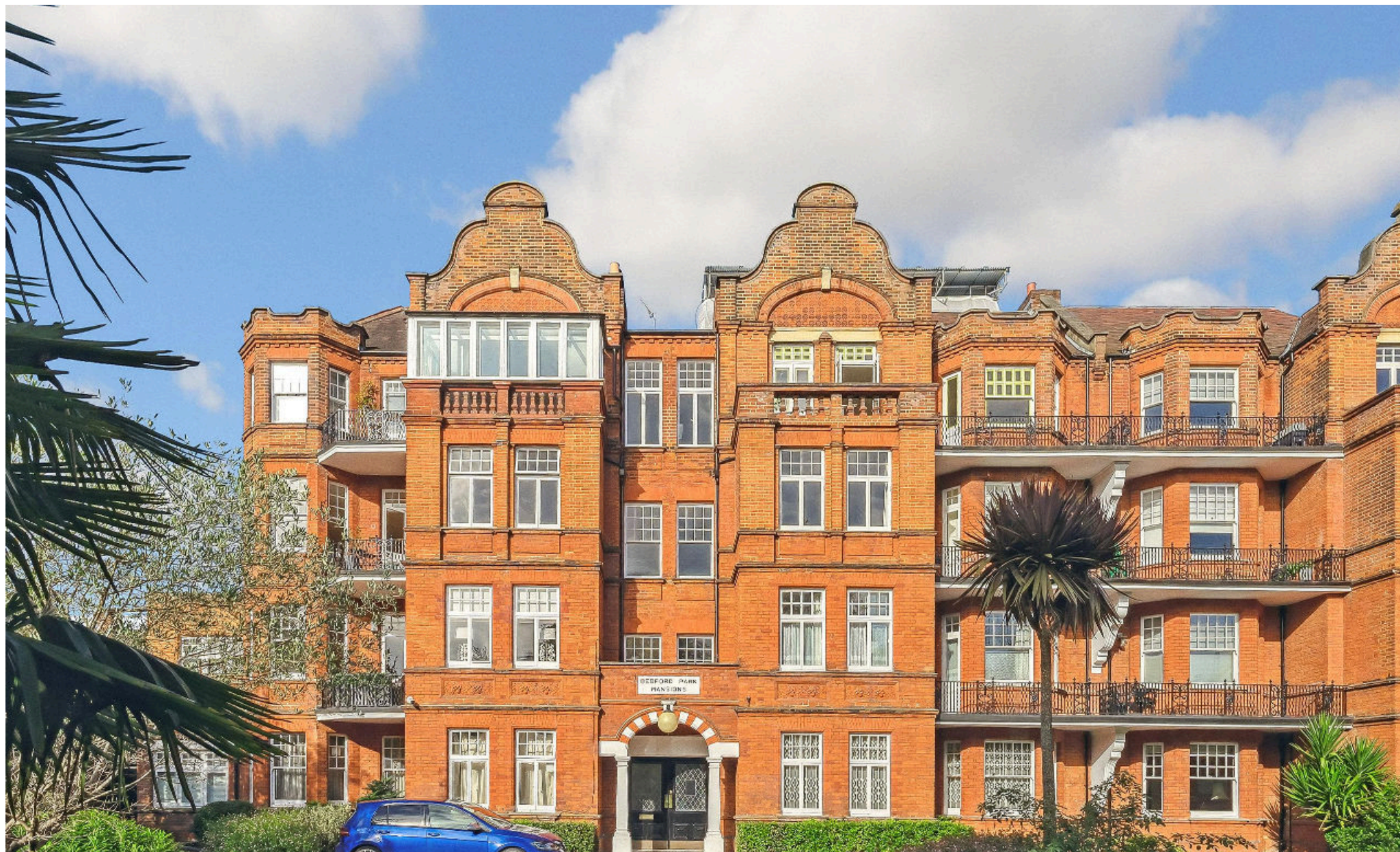
Bedford Park Mansions, The Orchard, W4