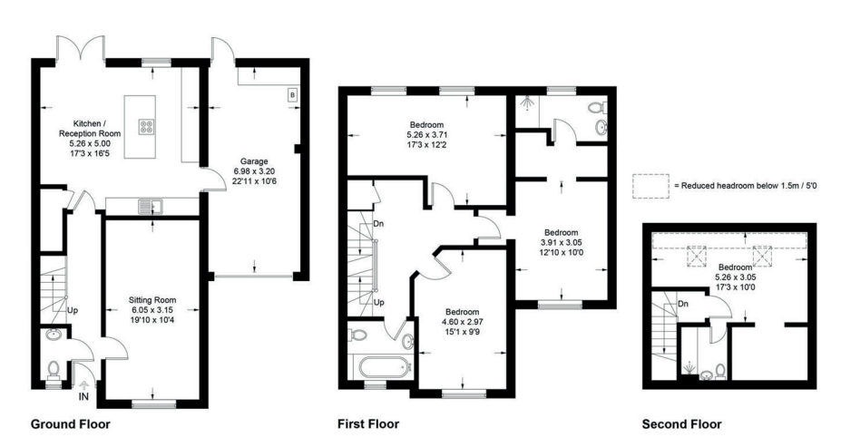
Illustration for identification purposes only, measurements are approximate, not to scale. floorplansUsketch.com @ (ID1102971)