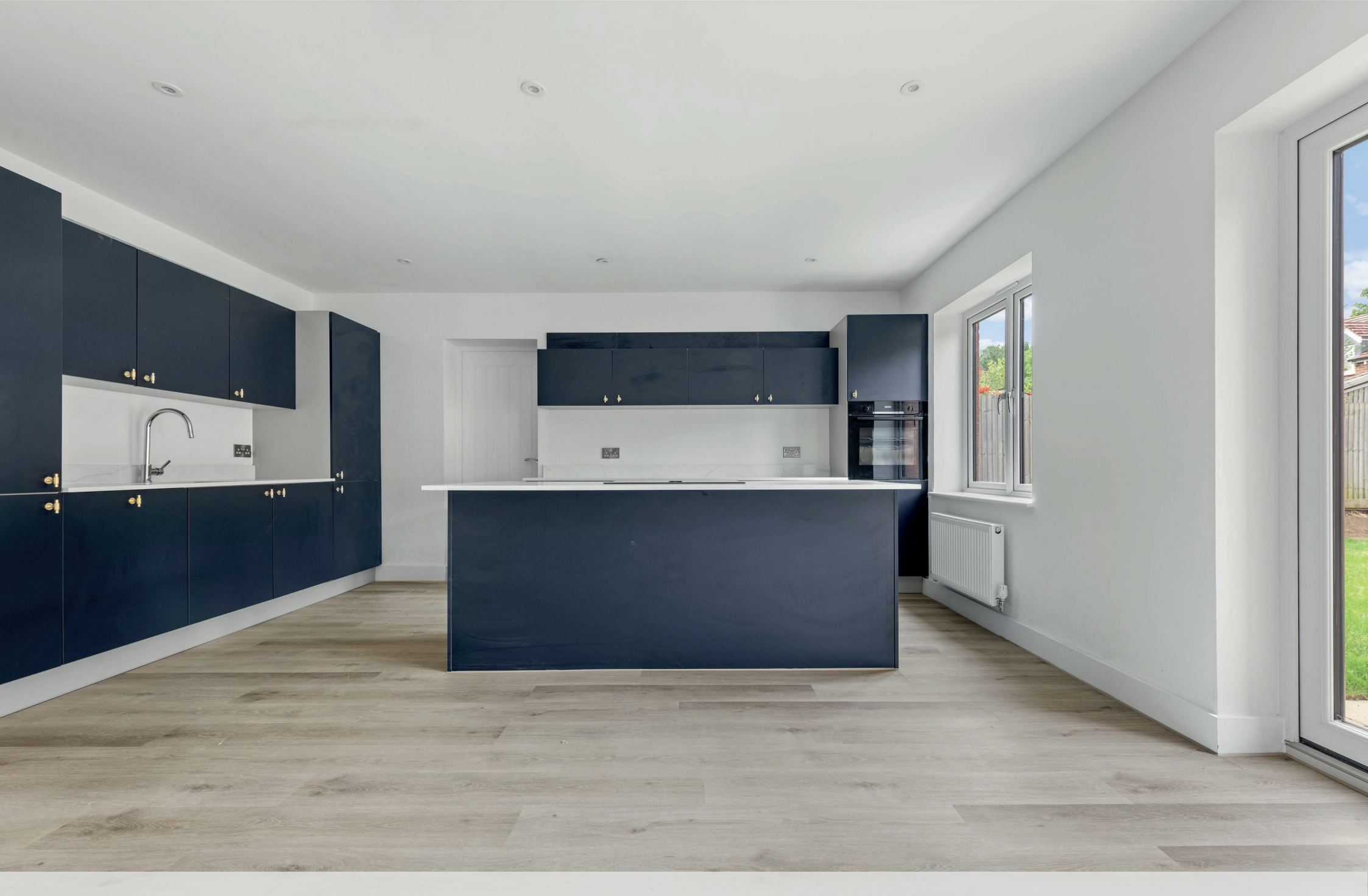
From 1,571 sqft arranged over three floors.