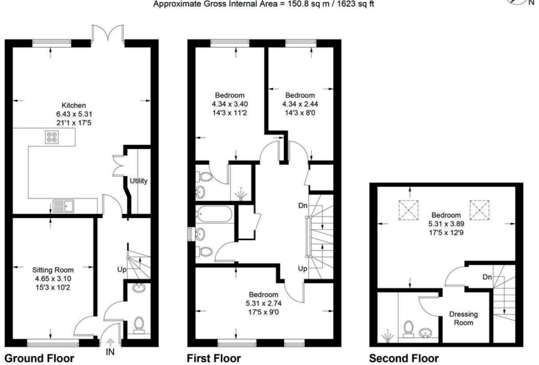
Illustration for identification purposes only, measurements are approximate, not to scale. floorplansUsketch.com @ (ID1102974)