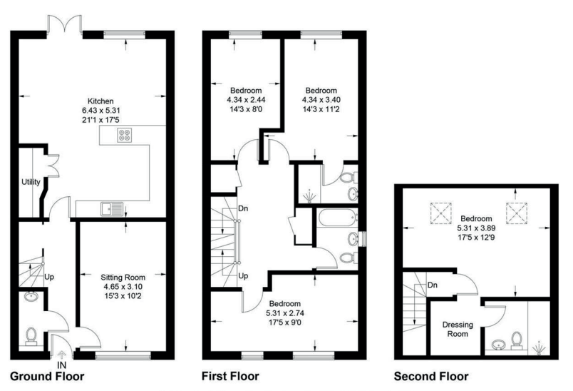
Illustration for identification purposes only, measurements are approximate, not to scale. floorplansUsketch.com (ID1102973)