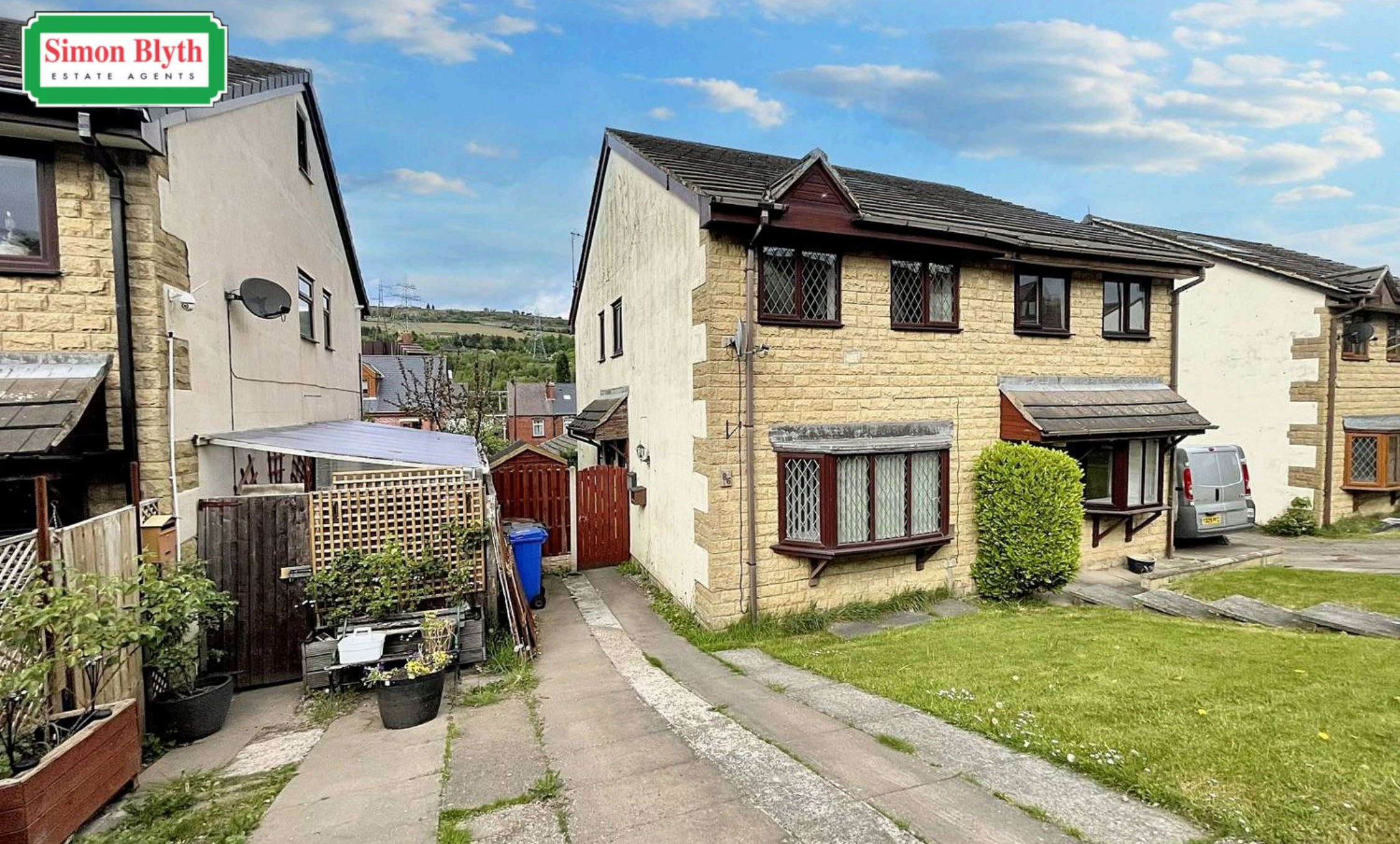
Paterson Close, Stocksbridge Sheffield