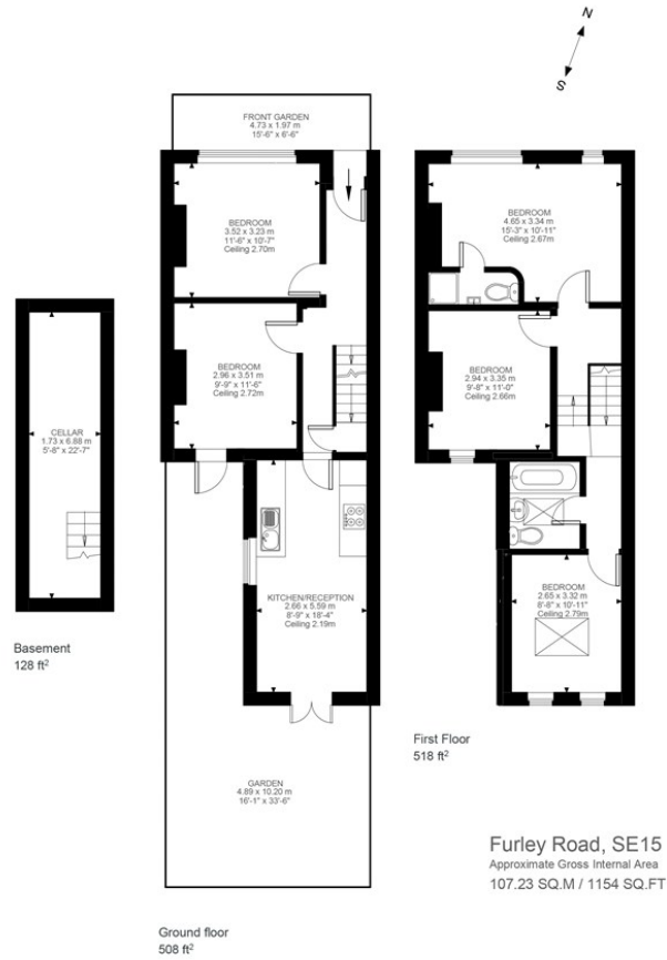
Illustration for identification purposes only. Not to scale. Floor Plan Drawn According To RICS Guidelines.