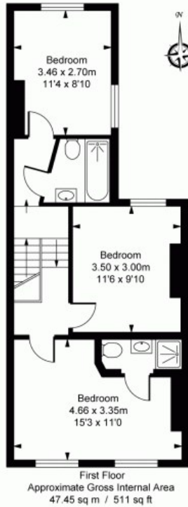
ILLUSTRATION FOR IDENTIFICATION PURPOSES ONLY ALL MEASUREMENTS ARE MAXIMUM AND INCLUDE WINDOW BAYS AND WARDROBES WHERE APPLICABLE THIS PLAN MUST NOT BE REPRODUCED BY ANY OTHER PERSON WITHOUT PERMISSION

Elcott Avenue, SE15 Approximate Gross Internal Area 94.93 sq m / 1,022 sq ft (CH = Ceiling Heights)