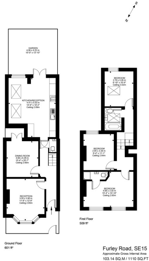
Illustration for identification purposes only. Not to scale. Floor Plan Drawn According To RIGS Guidelines.