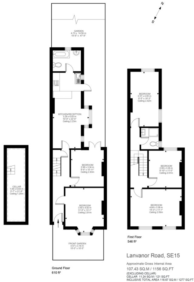
Illustration for identification purposes only. Not to scale. Floor Plan Drawn According To RICS Guidelines.