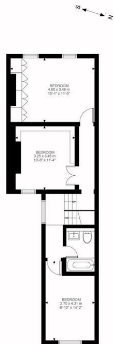
First Floor 595 ft²

Lyndhurst Way, SE15 Approximate Gross Internal Area 108.86 SQ.M / 1172 SQ.FT