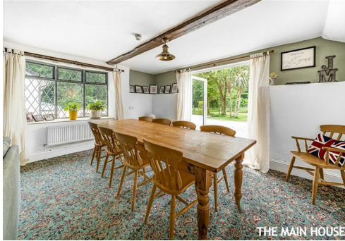
THE MAIN HOUSE