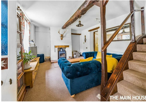
THE MAIN HOUSE