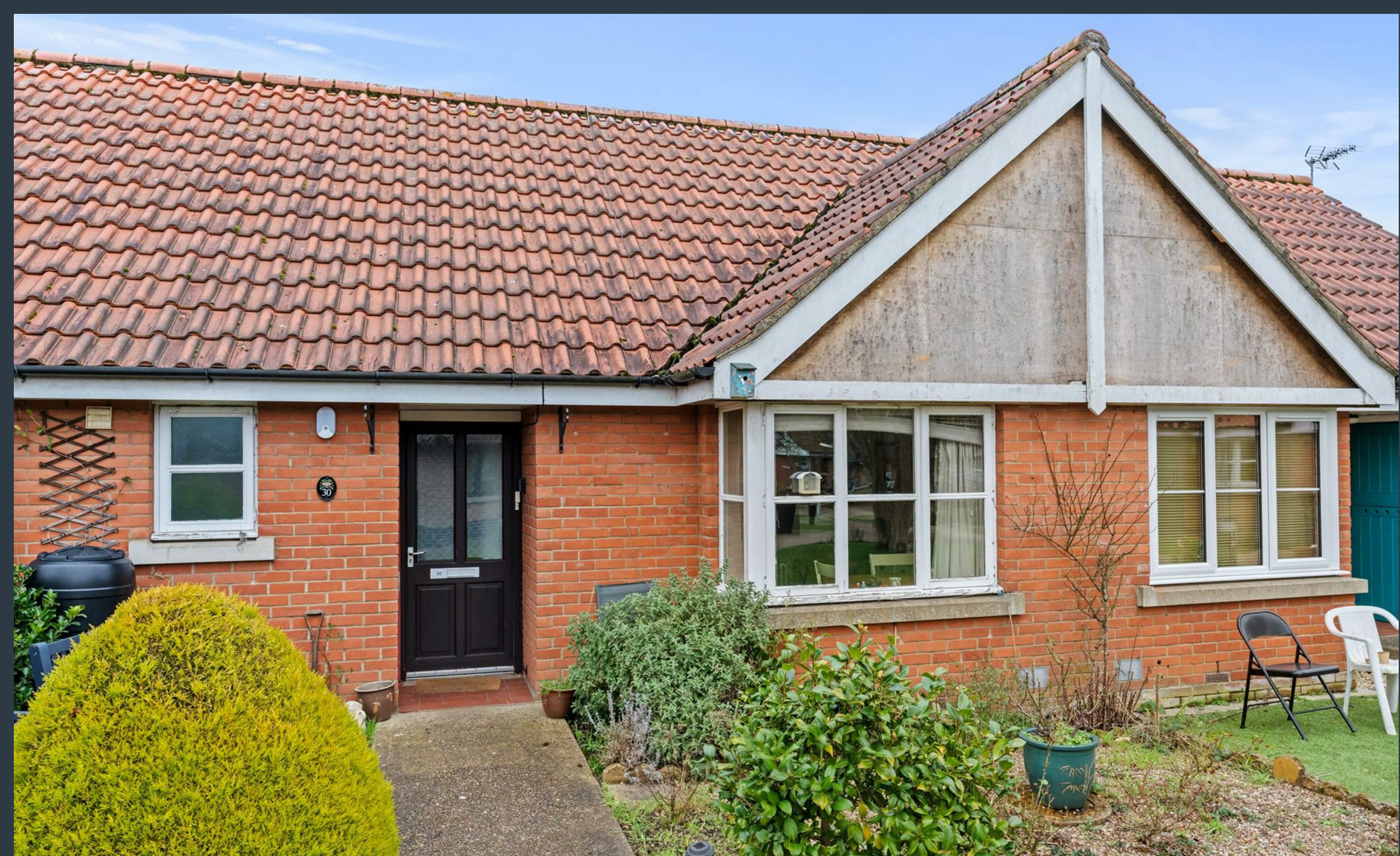
Violet Elvin Court Norwich, NR4 7JH Guide Price £170,000