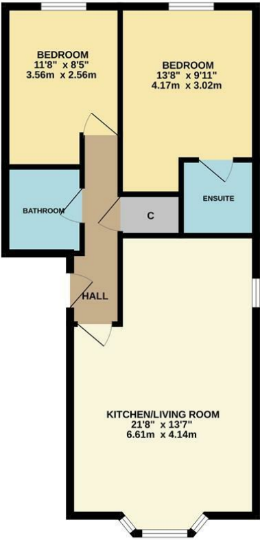
TOTAL FLOOR AREA : 595 sq.ft. (55.2 sq.m.) approx.

Whilst every attempt has been made to ensure the accuracy of the floorplan contained here, measurements of doors, windows, rooms and any other items are approximate and no responsibility is taken for any error, omission or mis-statement. This plan is for illustrative purposes only and should be used as such by any prospective purchaser. The services, systems and appliances shown have not been tested and no guarantee as to their operability or efficiency can be given. Made with Metropix ©2025