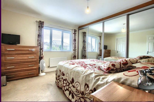
Ingleby Homes 6 Halegrove Court Stockton On Tees TS18 3DB