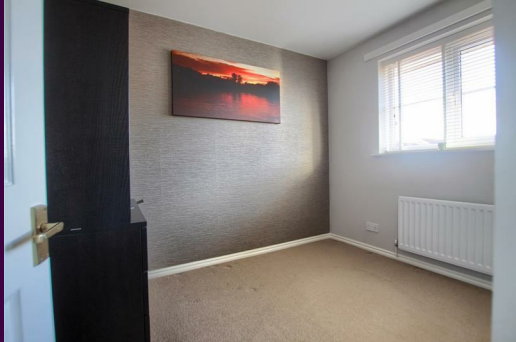
Ingleby Homes 6 Halegrove Court Stockton On Tees TS18 3DB