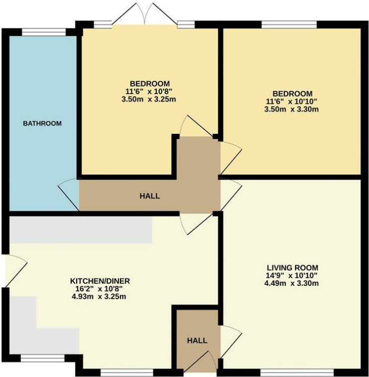
GROUND FLOOR 699 sq.ft. (64.9 sq.m.) approx.

Agents Note: Whilst every care has been taken to prepare these particulars, they are for guidance purposes only. All measurements are approximate and are for general guidance purposes only and whilst every care has been taken to ensure their accuracy, they should not be relied upon and potential buyers/tenants are advised to recheck the measurements