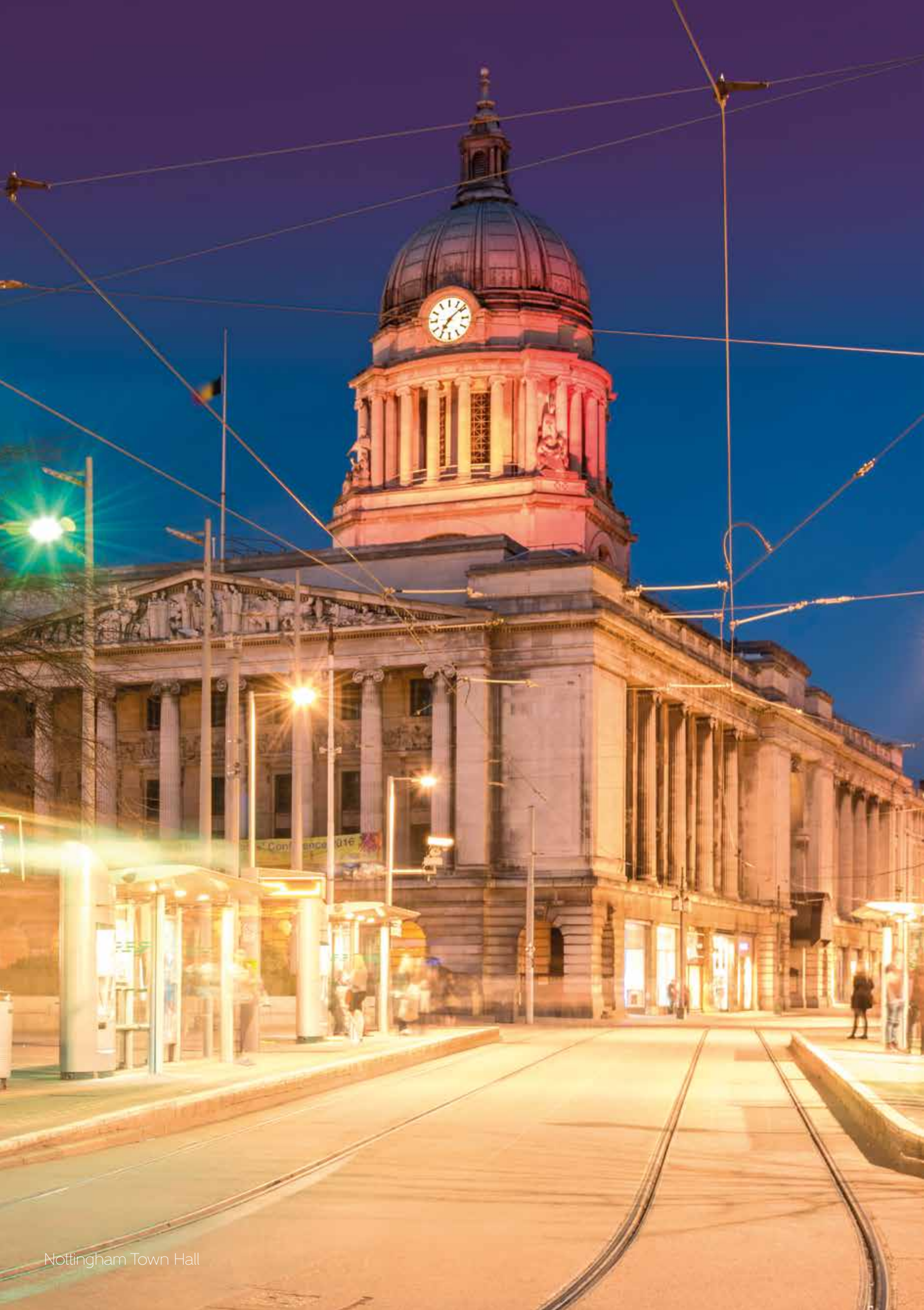
Nottingham Town Hall